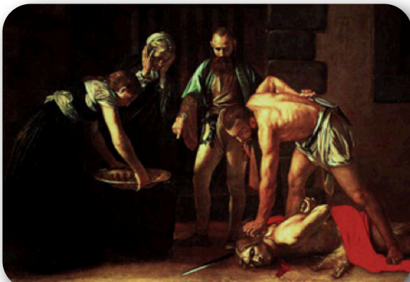
A. The Beheading of St John The Baptist by Caravaggio

Both Judith and Jael were the only women in the Old Testament accorded the status of "most blessed of women" (Baruch 13:23, Judges 5:24), shared by Mary. Both fulfilling the prophecy of the consequence of the original sin in Gen 3:15, " I will put enmities between thee and the woman, and thy seed and her seed: she shall crush thy head, and thou shalt lie in wait for her heel ". Judith and Jael severed and crushed the heads of the enemy generals, Holofernes and Sisera, (pictures C and D respectively); each is a Marian type heralding the arrival of our Lady, the true ' theotokos ', for our Lord Christ Jesus. The enemy offspring, Salome, daughter of Herodias and Herod, requested for the wrong head to be delivered due to spiritual blindness as St John is not the offspring who will deliver ultimate victory over the enemy, St John merely paved the way for the greater One to come. Amen