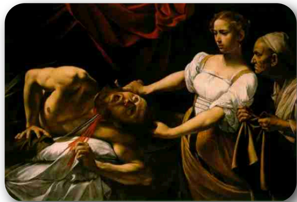
C. Judith Beheading Holofernes by Caravaggio