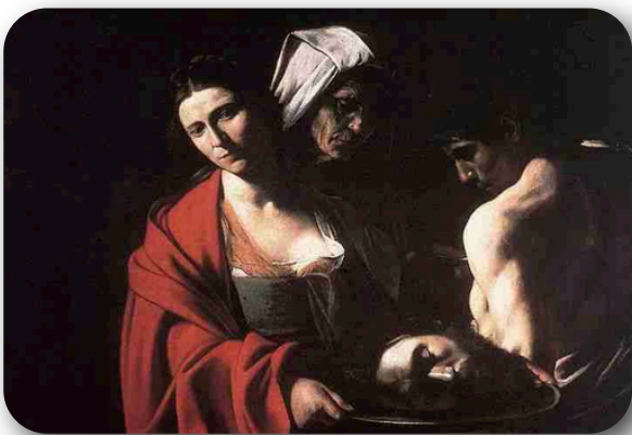
B. Salome with the Head of St John the Baptist (c.1609)